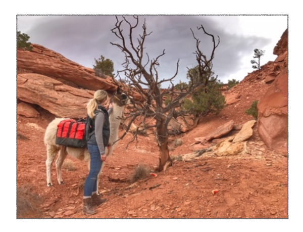
The Jaunt - 1 Hour Day Hike

With industry leaders as your guide and sturdy llama companions by your side this is one of the few things you get to do on your vacation that you will never forget. Llamas hike with us, carrying our extra water and snacks while we hike unencumbered through stunning Capital Reef Landscape. Llamas make wonderful trail companions and love hiking as much as we do! Not only do they carry most of our supplies, but they add a very unique element to our day trips, transforming a beautiful hike into an exotic animal experience as well.